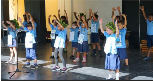
Our Stars of This Week!