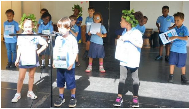
Year 1 Assembly about Environmentalism