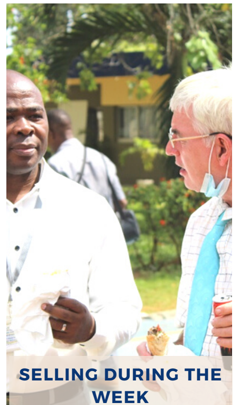
SELLING DURING THE WEEK