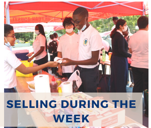
SELLING DURING THE WEEK