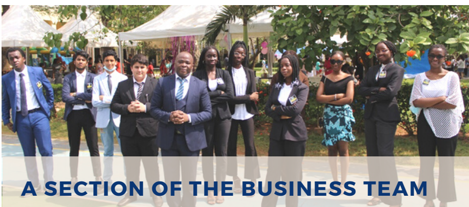
A SECTION OF THE BUSINESS TEAM