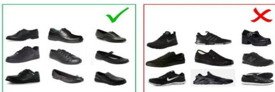
School footwear expectations